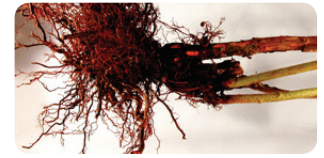
Crown and Root Rot